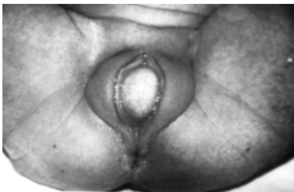
Figure 2: The preoperative photograph shows typical imperforate hymen.

tency with the last menstruation date was present. In the ultrasonography, an oval mass of 40x35mm with uniform echogenics was clearly observed in the fetal abdomen (Figure 1). The mass separated the boundaries with the sacrum in the posterior of the bladder and reached outward from the pelvis, also any dilatation of the gastrointestinal system was not observed. Except for the pressure caused by the mass, the structure and appearance of the bladder was found normal. The sex of the fetus was identified as female in the ultrasonography and the labium was found to be separated. No other anomalies were observed in the examination of the fetal anatomy. The amniotic fluid volume and placenta was normal. In the diagnosis of the mass, possibilities such as ovarian cyst, mesenteric cyst, anterior meningocele and its form developed in the anterior sacrococcygeal teratoma were considered. However, facts such as the fetus being identified as female and the separate condition of the labium make the diagnosis more likely that of congenital imperforate hymen and hydrometrocolpos. The conservative management was preferred