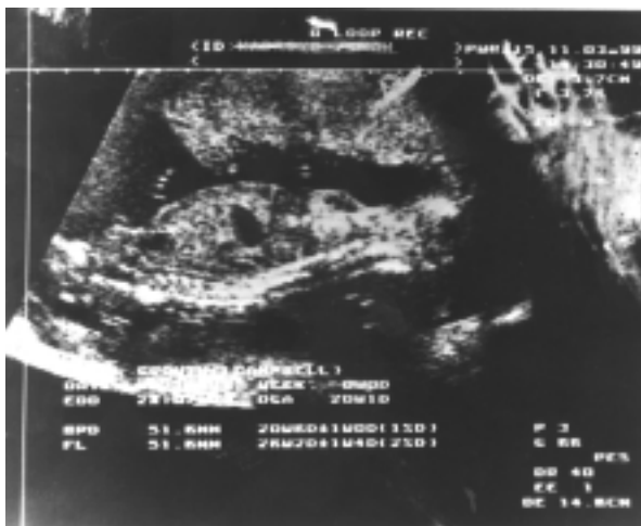
Figure 2. Ultrasonography shows narrow chest with protuberant abdomen.