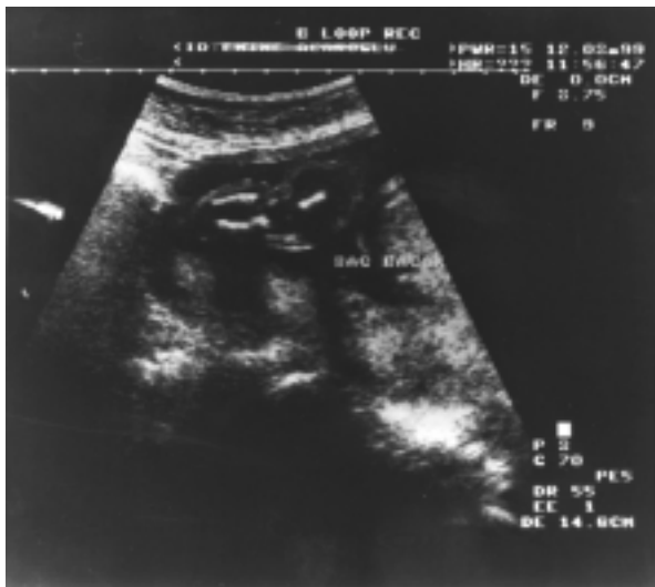
Figure- 1: Ultrasonographic appearance of shortened bowed extremity bones.

*The first column shows gestational week and the second shows percentile of the measurement for each case.