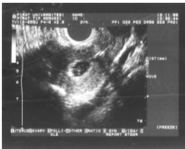
Figure- 5: Newborn with TD. Tetramicromelia, narrow chest with protuberant abdomen.